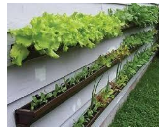
Wall container garden

What gardening activities can people of all ages do together? Everything, that is why gardening is so great!